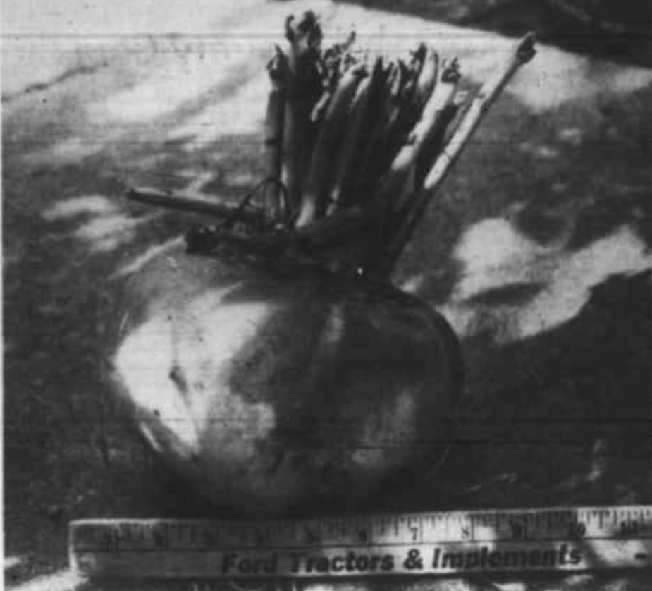
Big vegetable season

Tower running Six years ago U.S. Sen. John Tower narrowly squeaked a win over Democrat Bob Krueger, and speculation had it he might not run again in 1984. But stopping just short of formally announcing his re-election candidacy, Tower said he will not give up the seat, and doesn't expect GOP newcomer Phil Gramm to challenge him.